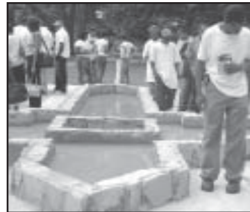
Ceremony visitors stand around the gothic cross fountain in the center of the peace garden.